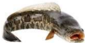
Figure 1. Snake-head fish ( Channa striata )

Waste from the fish processing industry is one of the problems in the fishery processing industry. The waste problem must be addressed with resolved properly and planned. Utilisation of Snake-head fish ( Channa striata ) bone as a source of minerals, especially calcium and phosphorus is an effort to increase the economic value of waste fish bones. The fraction of solid waste fishbone was about 10-15% of the fish weight as a whole excluding the skin, and it is a potential source for protein, unsaturated essential fatty acids, vitamins, antioxidants, amino acids and minerals (60-70%) in the form of inorganic salts, especially calcium phosphate, creatine phosphate and hydroxyapatite (Huang et al., 2011). Image of Snake-head fish is seen in Fig. 1.